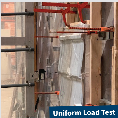
Uniform Load Test