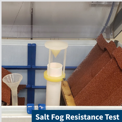
Salt Fog Resistance Test