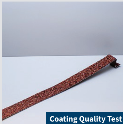
Coating Quality Test