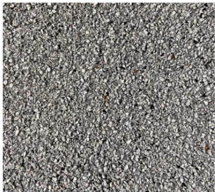
Mist Grey CC