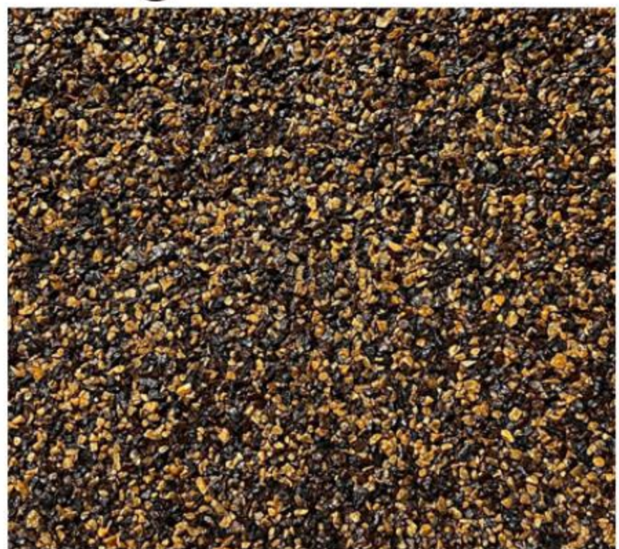
Antique Chestnut CC