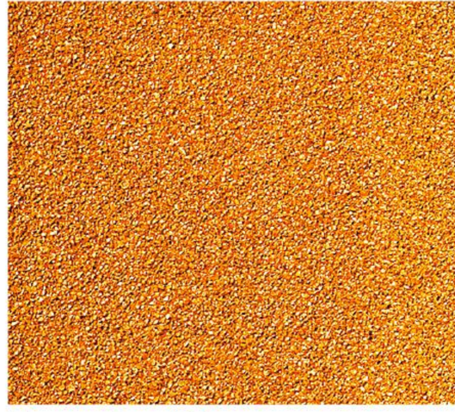
Tuscan Sun CC