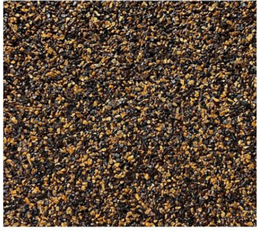
Antique Chestnut CC