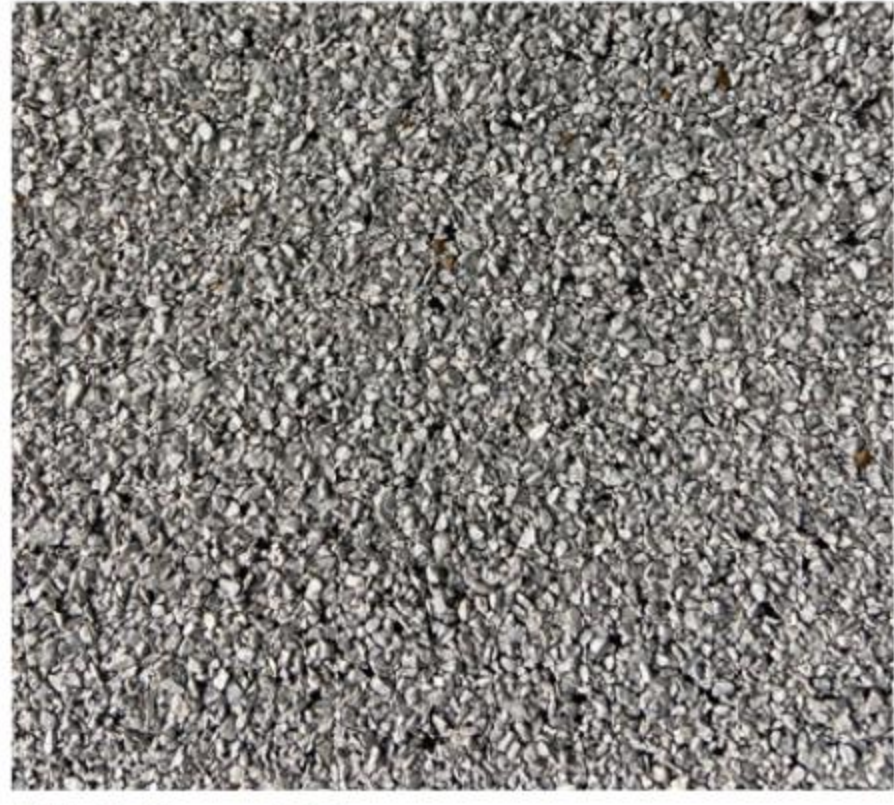
Mist Grey CC