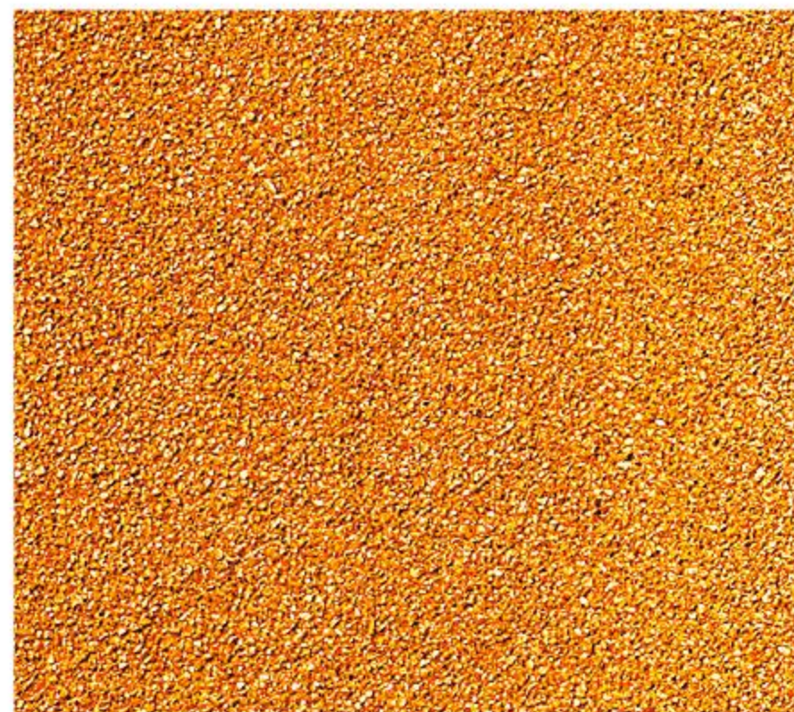
Tuscan Sun CC